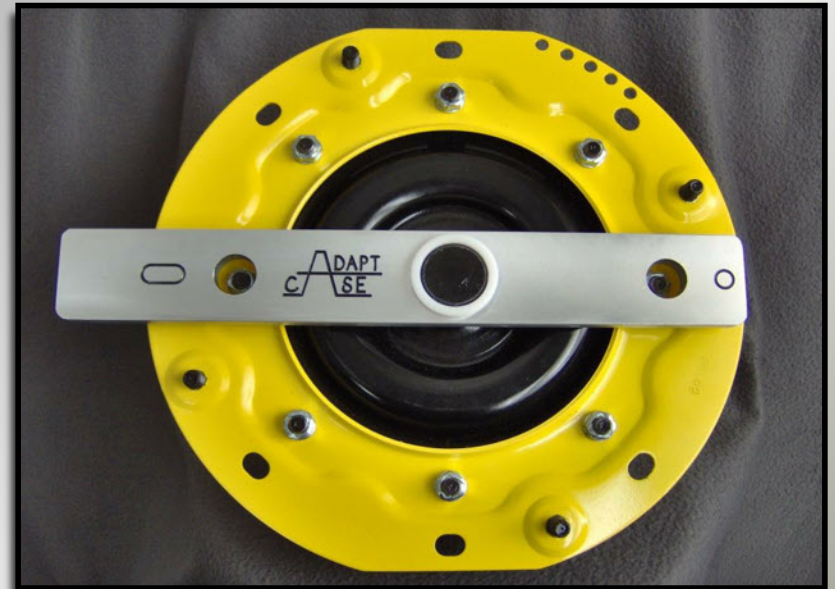
▲ Note the oval engraving on the left of tool and round to the right