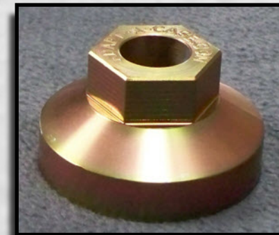
1 1/4" Hex to ease in-vehicle manual seal replacement!